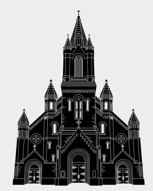
ST. LANDRY CATHOLIC CHURCH _____ Est. 1756 | Opelousas, LA _____