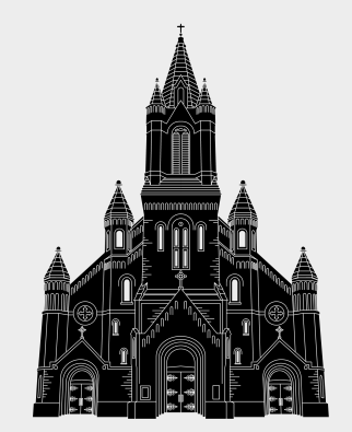
ST. LANDRY CATHOLIC CHURCH _____ Est. 1756 | Opelousas, LA _____