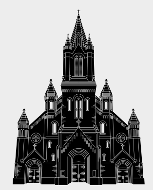
ST. LANDRY CATHOLIC CHURCH Est. 1756 | Opelousas, LA