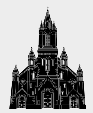
St. Landry Catholic Church Est. 1756 | Opelousas, LA